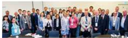
Collaboration with other Societies→