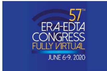
Virtual Congress 2020