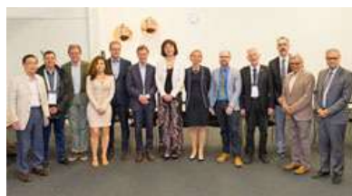
SAB (Scientific Advisory Board) Activity (Research, Young Fellowship Programme, Awards)