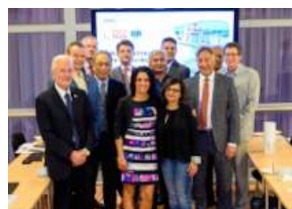
Collaboration with other Societies