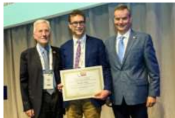
FERA (Fellow of the European Renal Association)