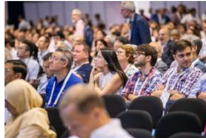
Education and CEPD