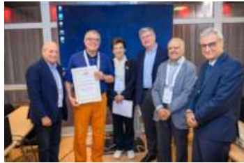
ERA-EDTA Ethics Committee