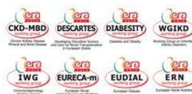
ERA-EDTA Working Groups