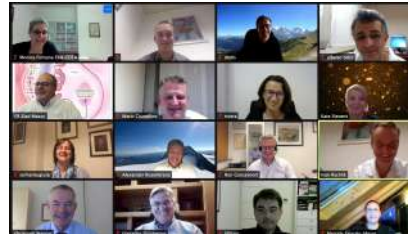
Election of Ordinary Council Members 2021