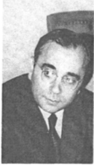
Fig. 8. Fig. 9.