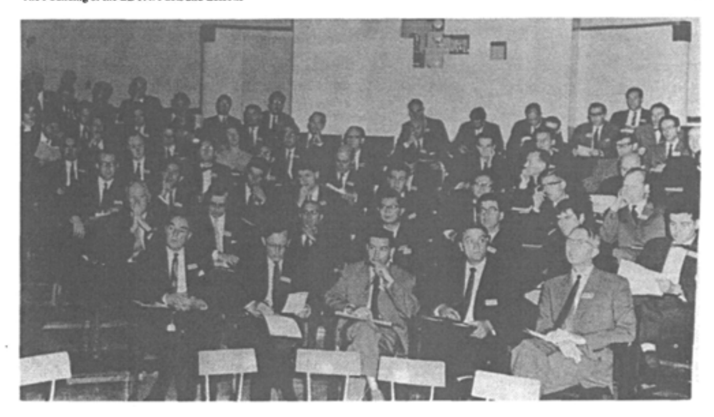
Fig. 5. Participants in the first EDTA congress at Amsterdam (1964).

interest of the association who were working in Europe and adjacent territories.