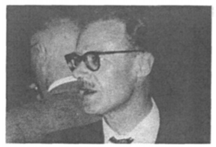
Fig. 13. Frank Parsons from Leeds, UK presented the first Registry report on transplantation in 1965.