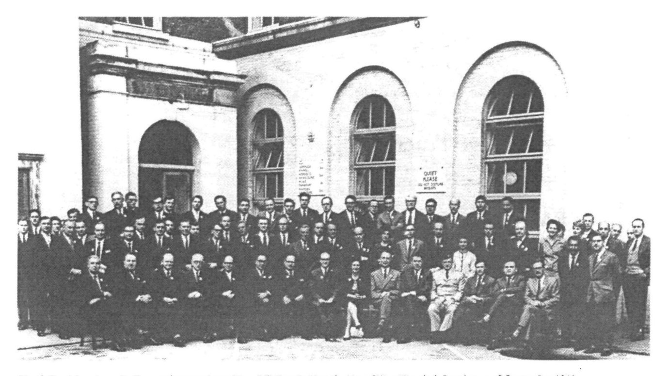
Fig. 1. Participants at the Symposium on Acute Renal Failure held at the Royal Free Hospital, London, on 2 September 1963.

Table 1. Drawbacks of large international congresses